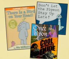
Texts for Fluency