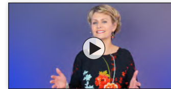
Tweak the Six-Traits rubric for different units.