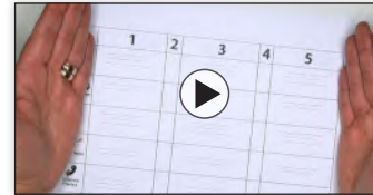
Use a Six-Traits rubric for efficient assessment.

Conventions Citations are punctuated correctly.