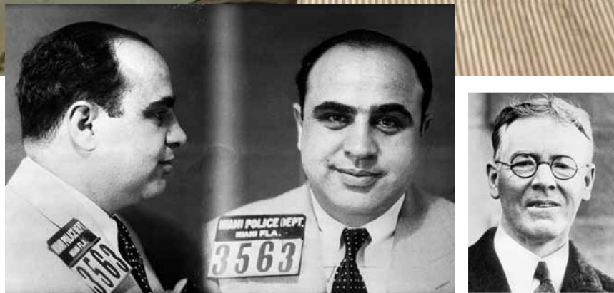
TOP: The hole that Frank Morris carved in his jail cell, along with the fake wall he made out of cardboard. LEFT: Legendary Alcatraz inmate Al Capone was known as “Public Enemy Number One.” RIGHT: Famous Alcatraz Warden James A. Johnston.

Capone. To many, Capone symbolized the collapse of law and order in the 1920s. He made millions running illegal gambling joints in Chicago. He was said to have murdered at least a dozen people. Capone was used to having power, and he was proud of his reputation as a big shot. He figured he'd be able to pull strings to get special privileges at Alcatraz, just like he had in other prisons.